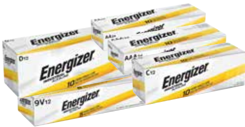
EN91 AA (24/pk)