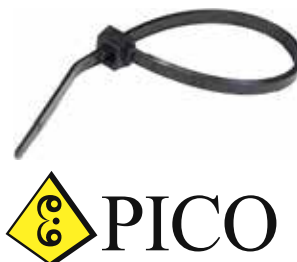
7066-0C - 7.5"