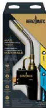
Max Performance Torch TS8000T