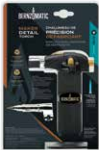
Maker Detail Torch ST2200T