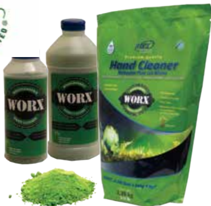
WORX® Biodegradable Hand Cleaner #11-1650-12 #11-1104 #11-2300