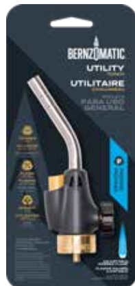
Utility Torch WT2301