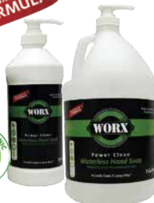
WORX® Power Clean Hand Soap #36-0432 #36-0401