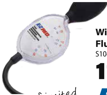
Windshield Washer Fluid Hydrometer S104