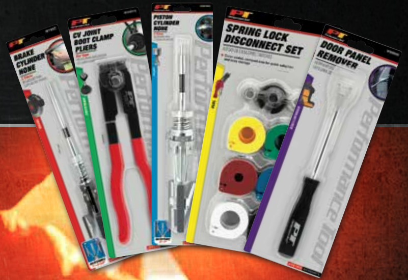
PROFESSIONAL HAND TOOLS