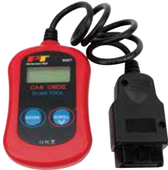
Can OBDII Diagnostic Scan Tool W2977