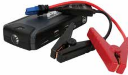
600 Peak Amp Power Bank and Jump Starter W16751