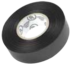
Black Electrical Tape 3/4" x 60' W502