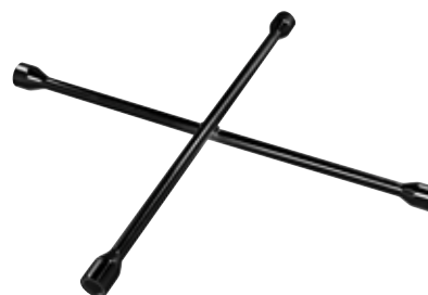
20" SAE/Metric 4-Way Lug Wrench W1