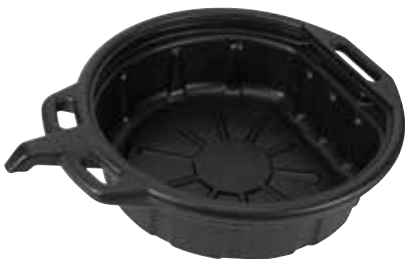
4-1/2 Gallon Oil Drain Pan W4071