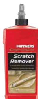
California Gold Scratch Remover 38408 236 ml