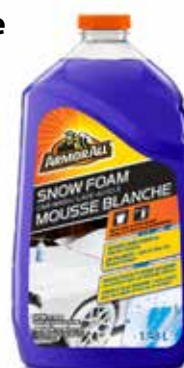
Snow Foam Car Wash 19159 1.48L