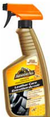
Premium Leather Care 18981 473ml