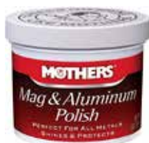
Mag & Aluminum Polish 35100 5oz