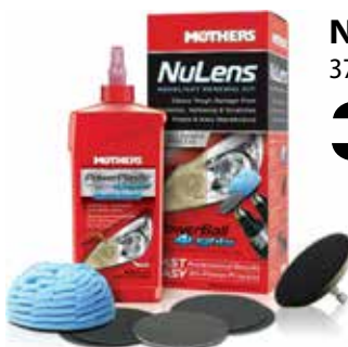
NuLens Headlight Renewal Kit 37251