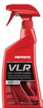
VLR Vinyl•Leather•Rubber Care 36524 709 ml